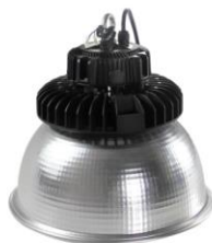
90° Aluminum Reflector