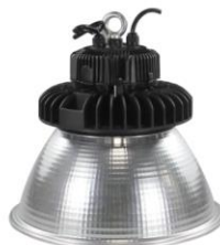
60° Aluminum Reflector

for more information email info@emium.com or call 224.735.3435 | www.emium.com