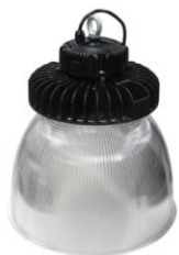
60° PC Reflector