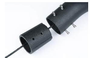
Pole Mount Fits 2-3/8" or 3" Tenons